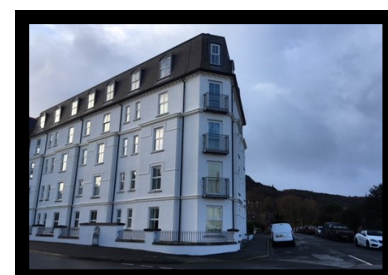
Yew Tree Apartments