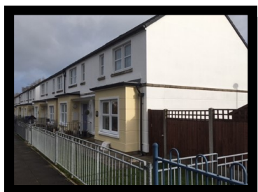
Lezayre Housing Estate